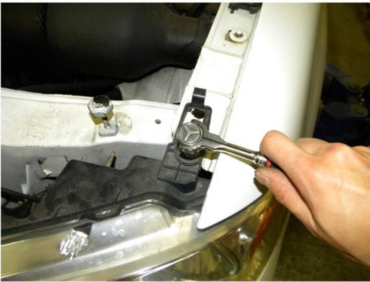
5. Remove the 10mm bolt