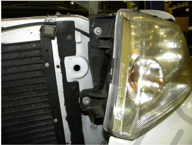
1. 10mm and 8mm bolt locations