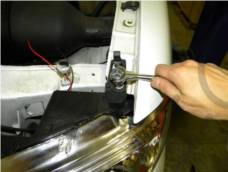
13. Tighten the 10mm bolt