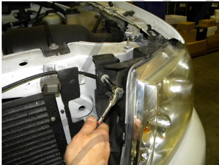
3. Remove the 8mm bolt