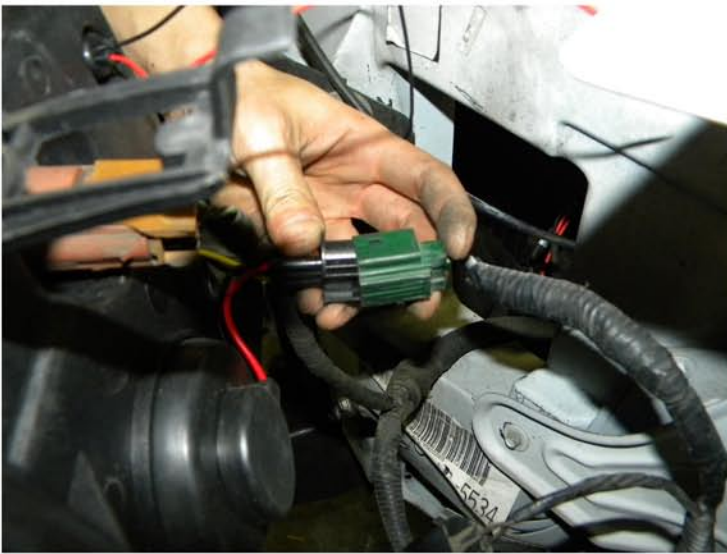
11. Connect the headlight harness to the new headlight