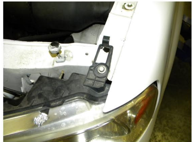
4. 10mm bolt location