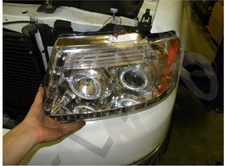
12. Place the new headlight into the stock location