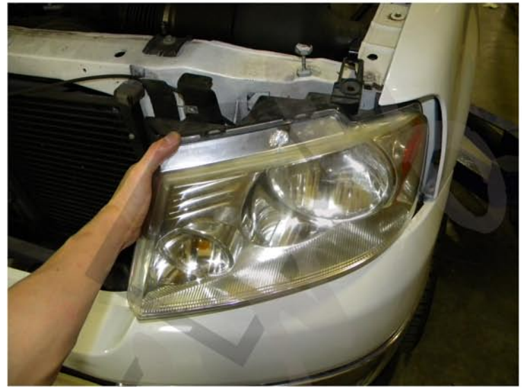
6. Remove the headlight