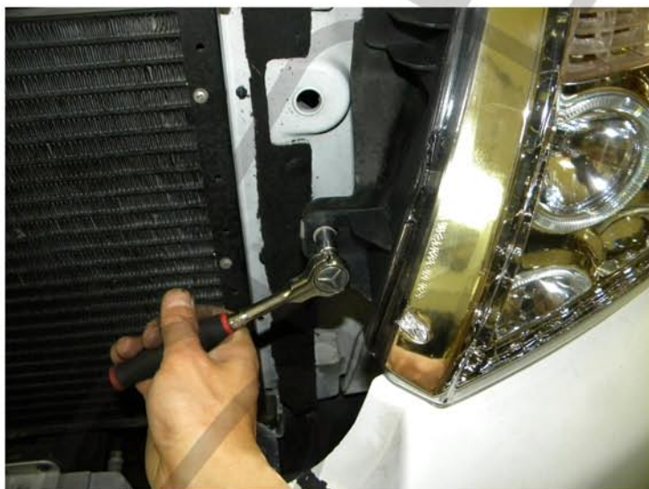
15. Tighten the 10mm bolt

Please repeat the steps in order from 1 to 15 for the opposite side