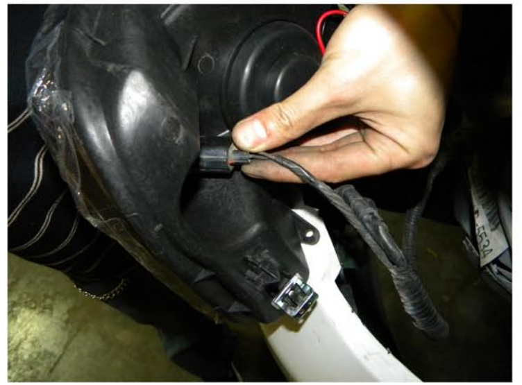
10. Connect the headlight harness to the new headlight