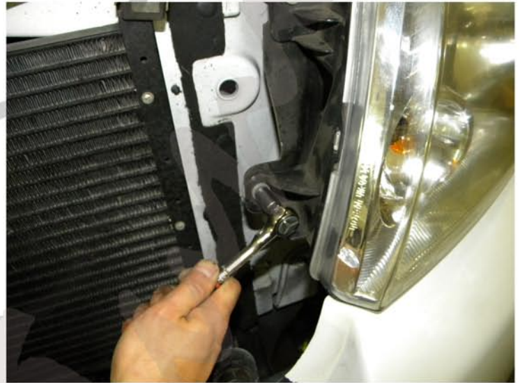
2. Remove the 10mm bolt