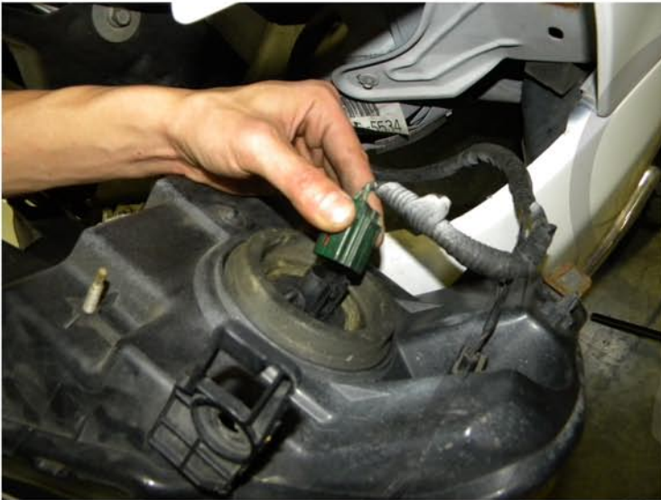
7. Disconnect the headlight harness