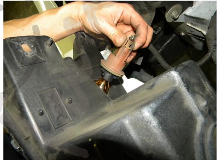
8. Remove the headlight harness