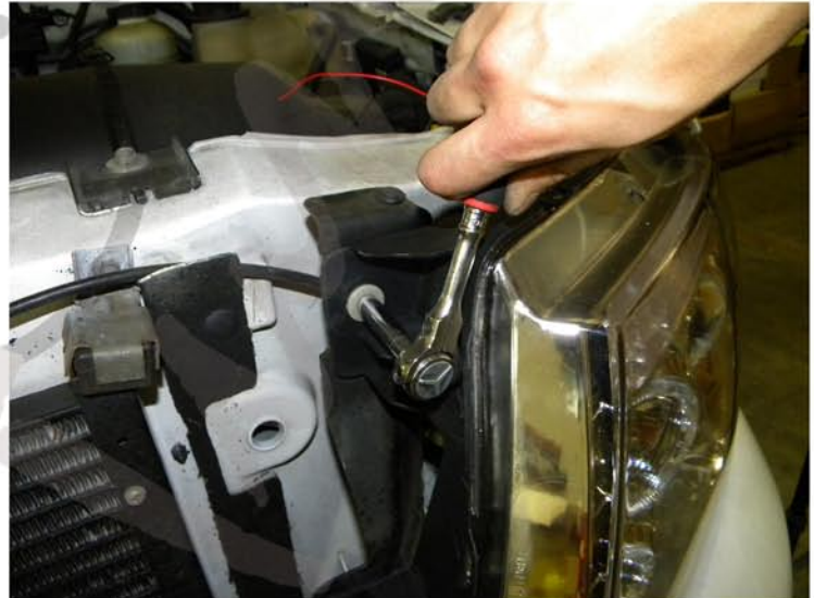
14. Tighten the 8mm bolt