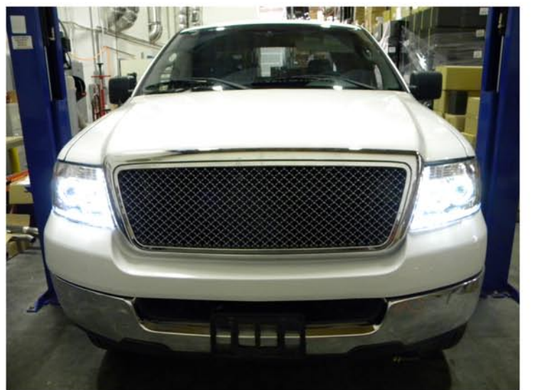
16. The installation is now complete

Please repeat the steps in order from 1 to 15 for the opposite side