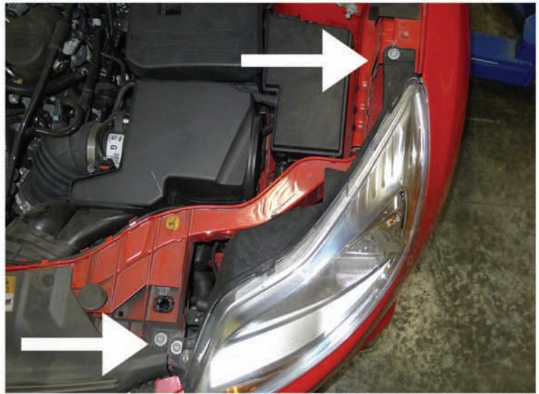
2. (2) T30 bolts location