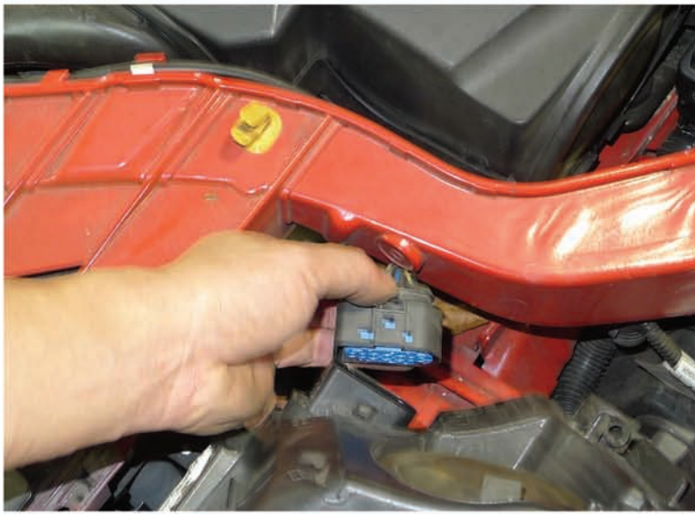
5. Disconnect the headlight harness and remove the headlight