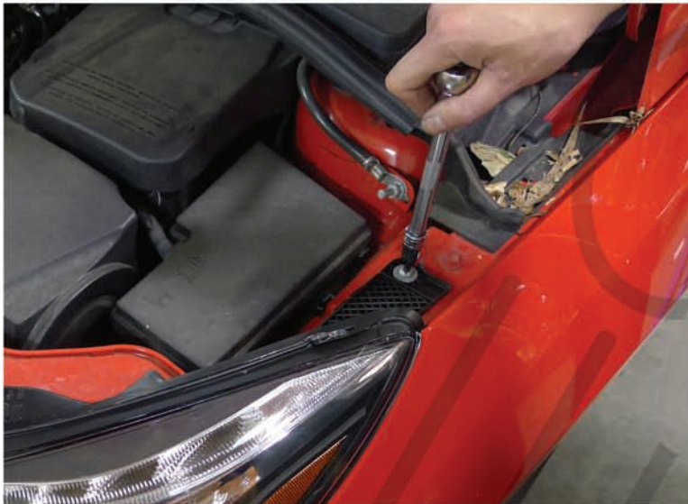
7. Tighten the (2) T30 bolts