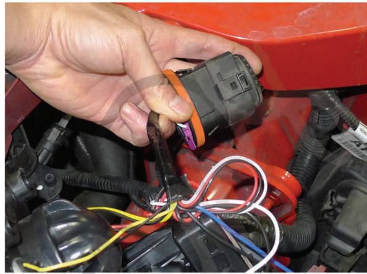
6. Connect the headlight harness to the projector headlight