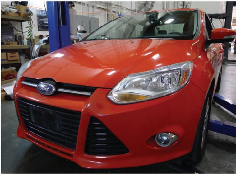
1. (2) 10mm bolts and 9 8mm bolts location

Do not make direct contact with the halogen bulbs or the wire assembly until the unit has cooled down after use.