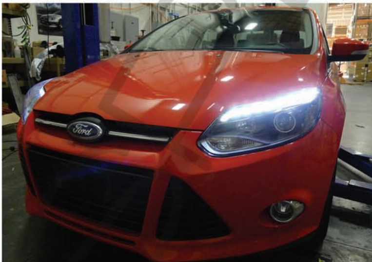
9. The installation now is complete