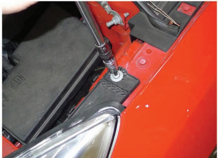
4. Remove the (2) T30 bolts