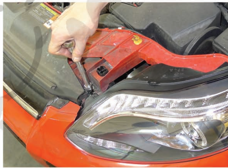
8. Tighten the (2) T30 bolts Please repeat the steps from 1 to 8 for the opposite side