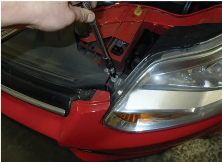
3. Remove the (2) T30 bolts