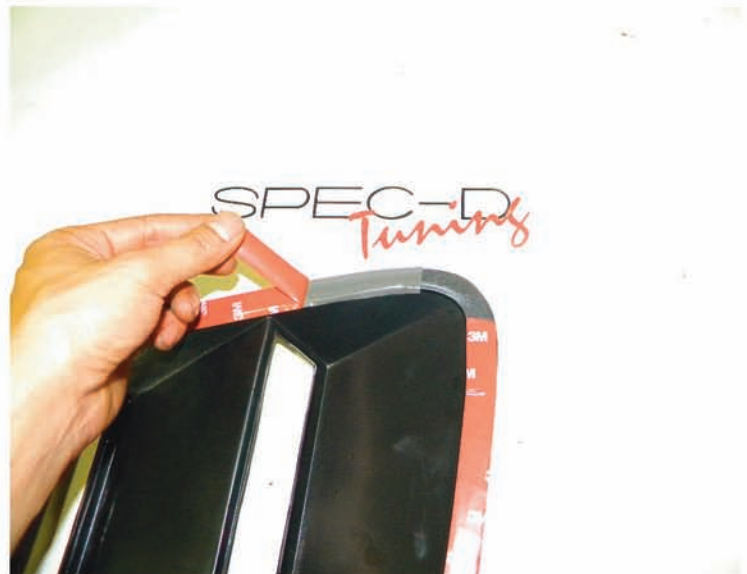
4. Peel off the backing