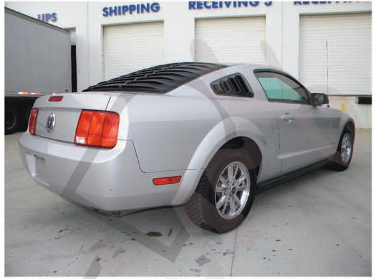
6. Please repeat the steps from 1 to 5 for the opposite side