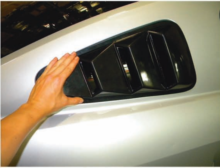
5. Apply and press louver onto window firming