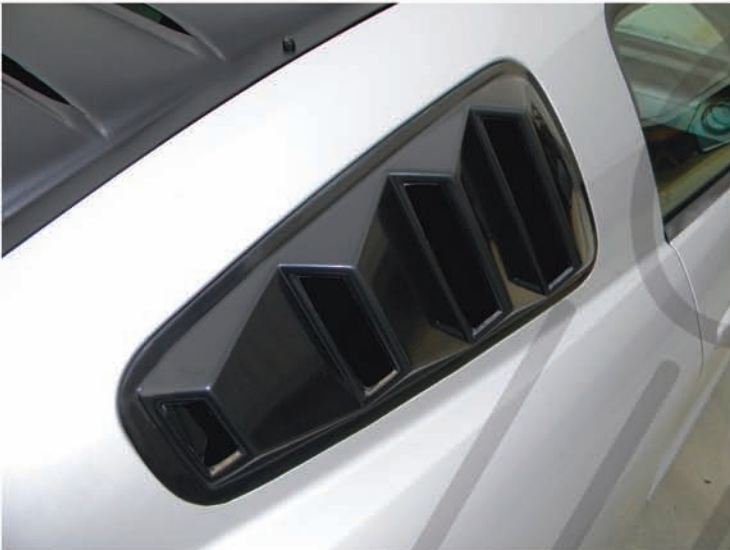
7. The installation is now complete