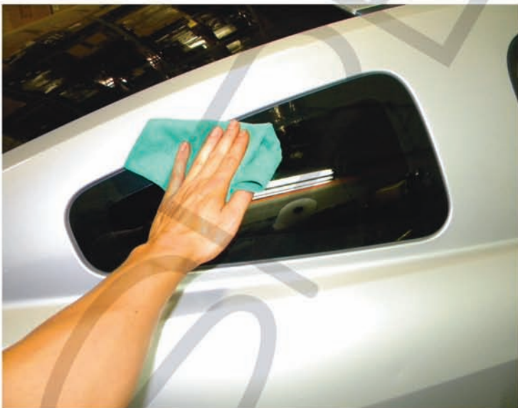
3. Wipe the window surface clean