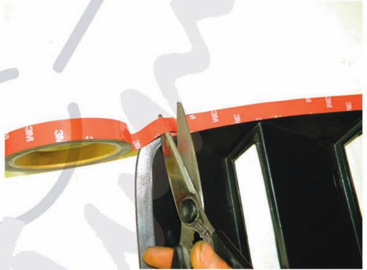
2. Cut the foam tape to length