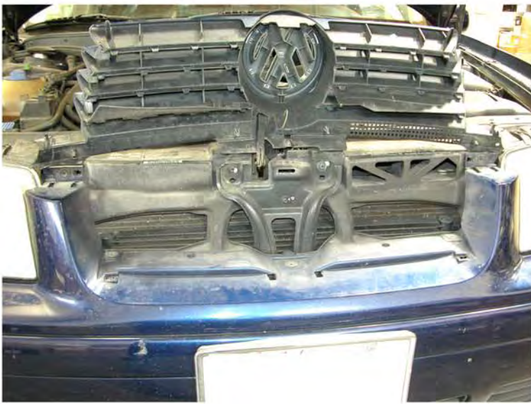
5. After you pull the grille up, it should look the same as the picture shown above