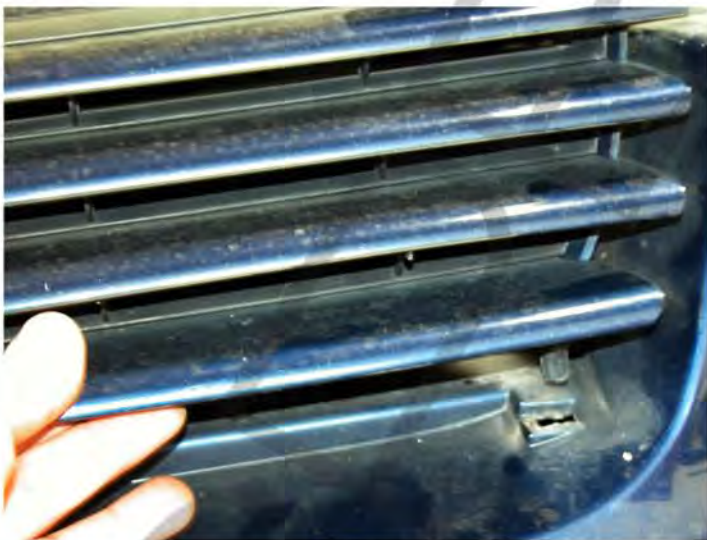
3. Pull up the grill