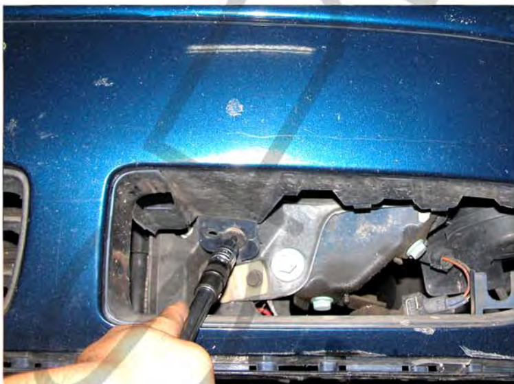
21. Install the bolts to the fog light opening