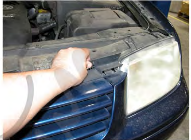
2. Remove the plastic shielding from the top of the headlight