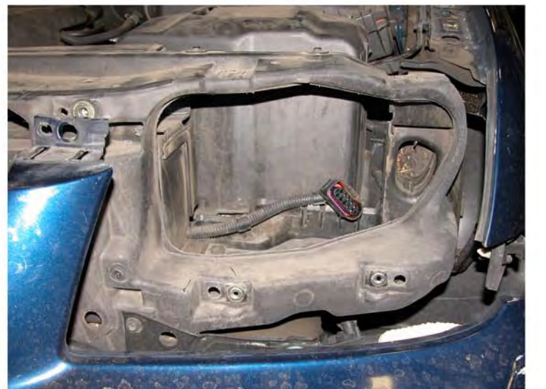
16. After removing the headlight, it should look the same as the picture shown above