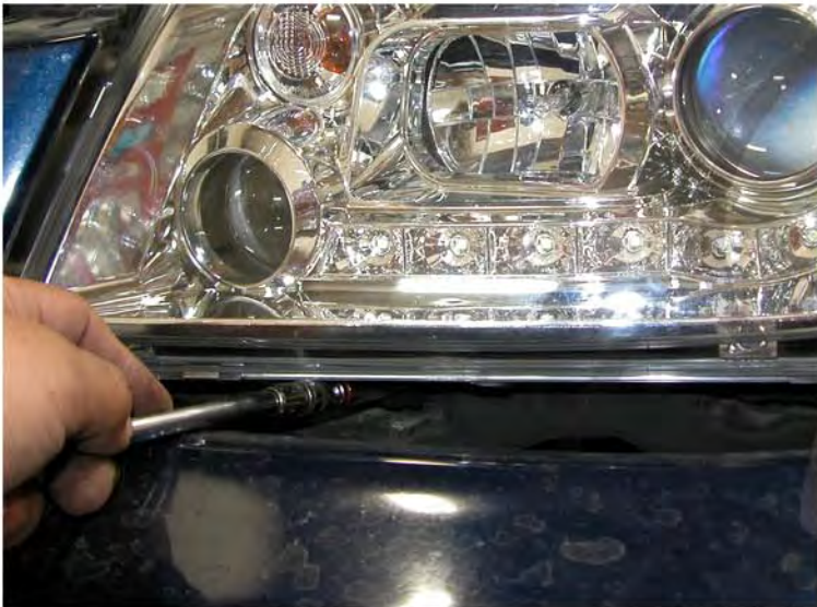
19. Install the bolts below the headlight between the bumper