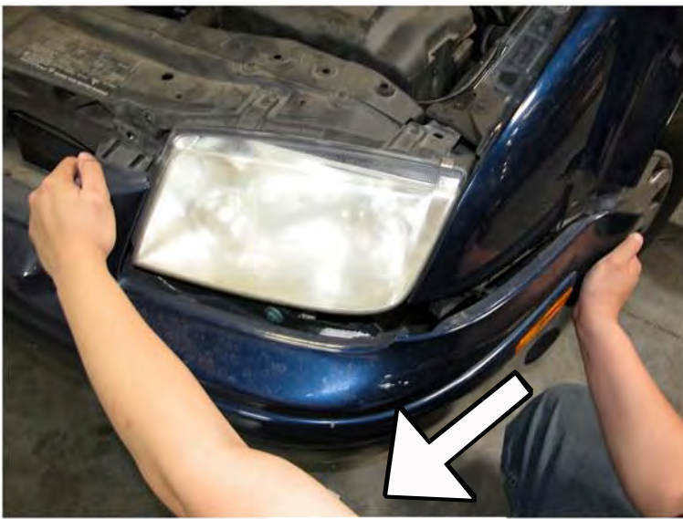
11. Gently pull out the bumper slightly, just enough to see the bottom of the headlight