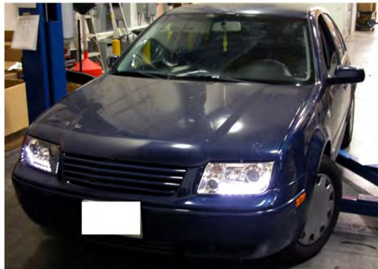
28. The installation is now complete