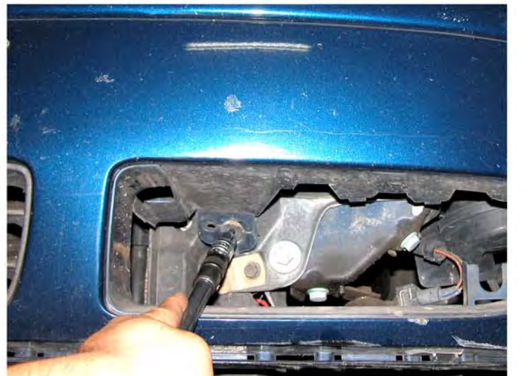
10. Remove the bolts from the fog light opening