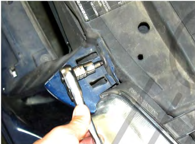
7. Remove the top clip