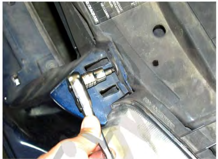
24. Install the top clip