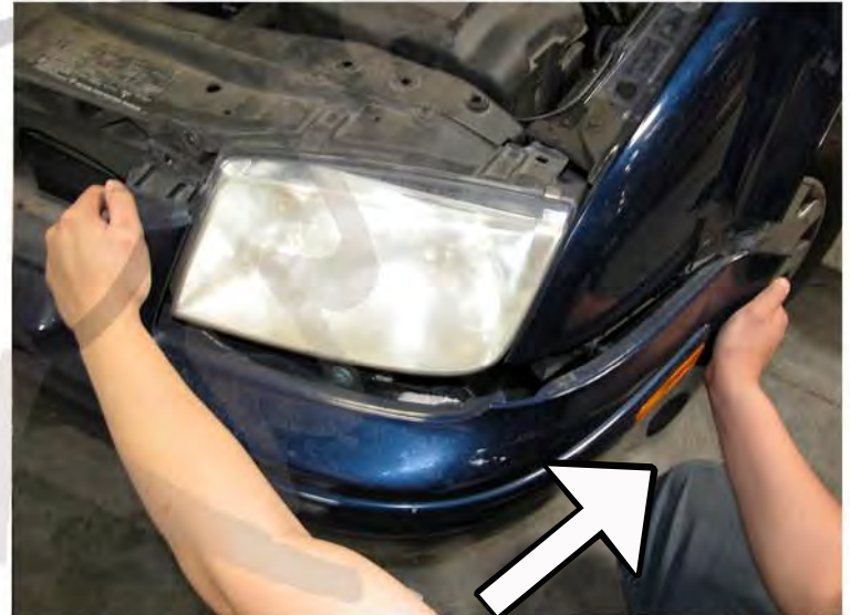
20. Gently put the bumper to its original position