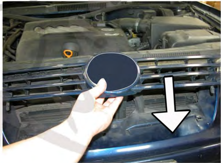
26. Put the grille back