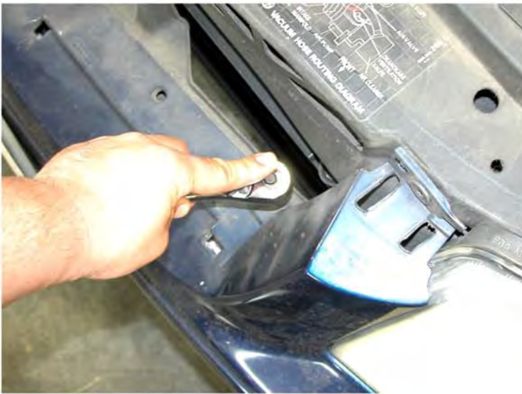
23. Install the bottom clip on top of the front bumper