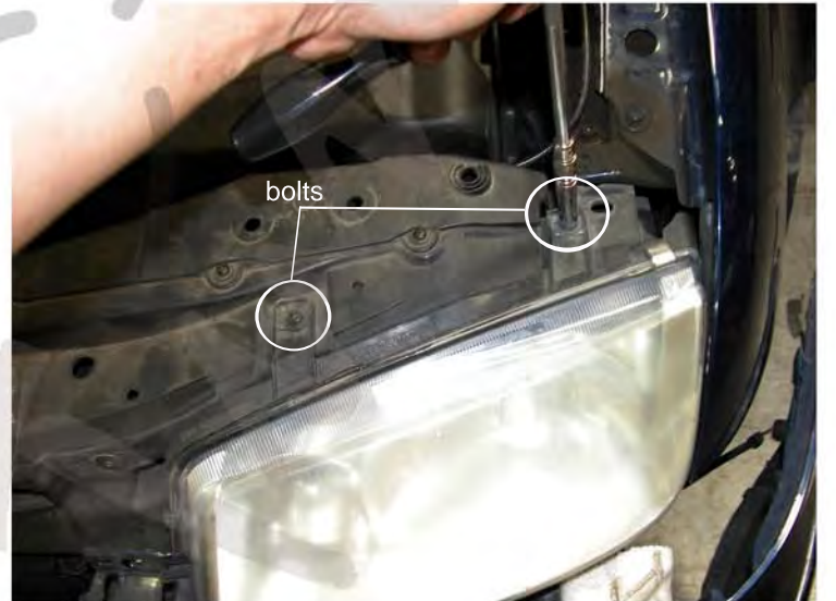
14. Remove the two bolts on top of the headlight