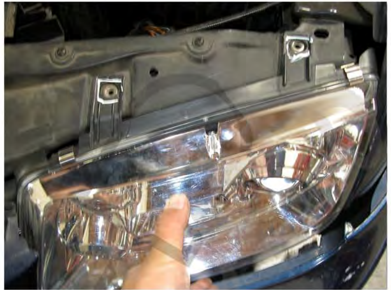
18. Gently install the projector headlight to its original spot and install the bolts to fasten the headlight