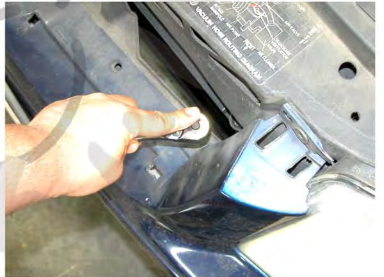
8. Then remove the bottom clip