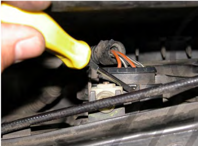
13. Use a flat tip screwdriver to disconnect the connector from headlight and vehicle