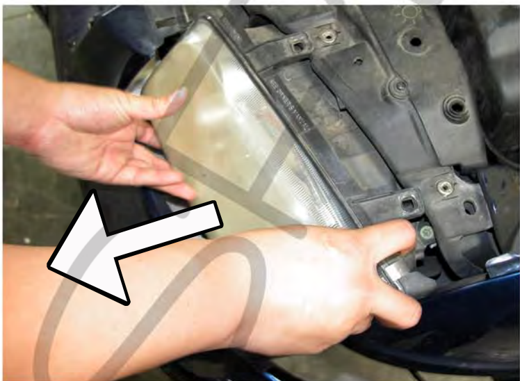
15. Gently pull out the headlight