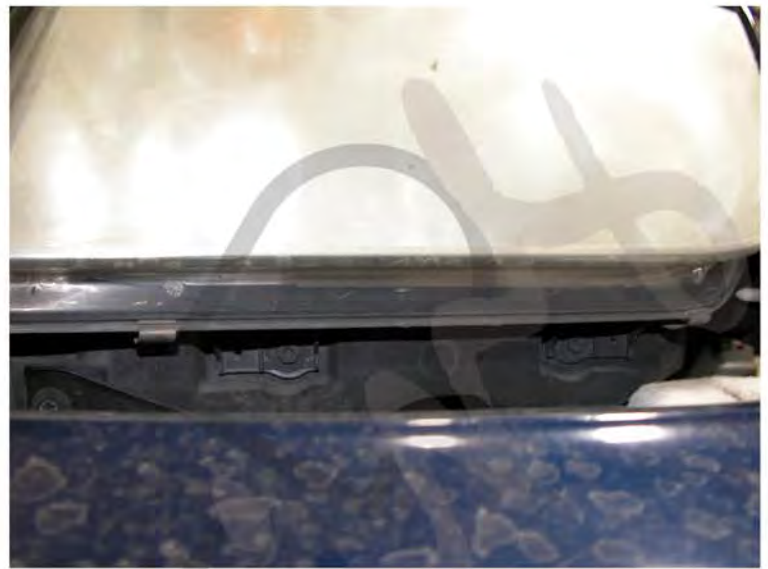
12. After you pull the bumper slightly, it should look the same as the picture shown above