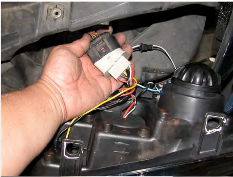
17. Connect the connector with thr headlight please see the "Halo and L.E.D. installation instructions" If your headlights don't have HALO or L.E.D. You can skip the installation instructions.