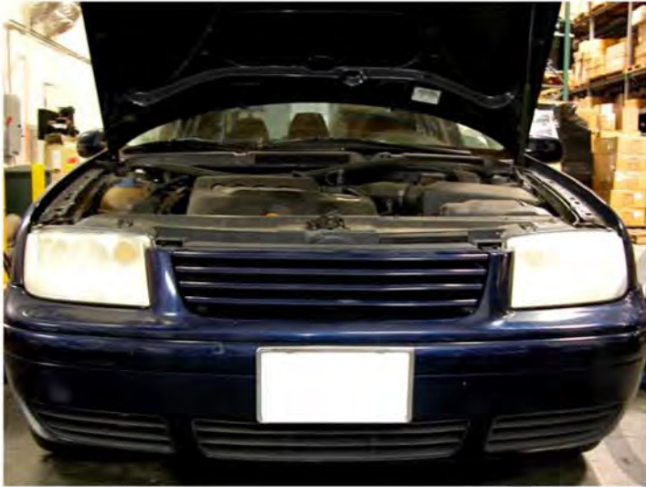
1. Open the hood