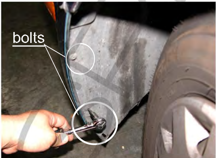
9. There are two bolts underneath the fender that needs to be removed also