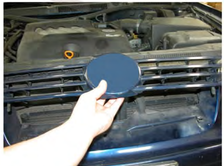
4. Pull up the grille on the vehicle