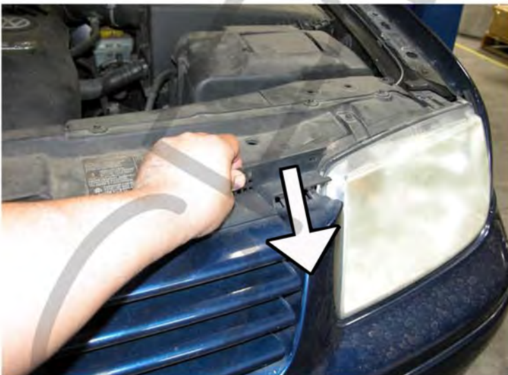
27. Put the plastic shielding back on the top of the headlight (Please repeat the picture order from 1 to 27 for the opposite side)