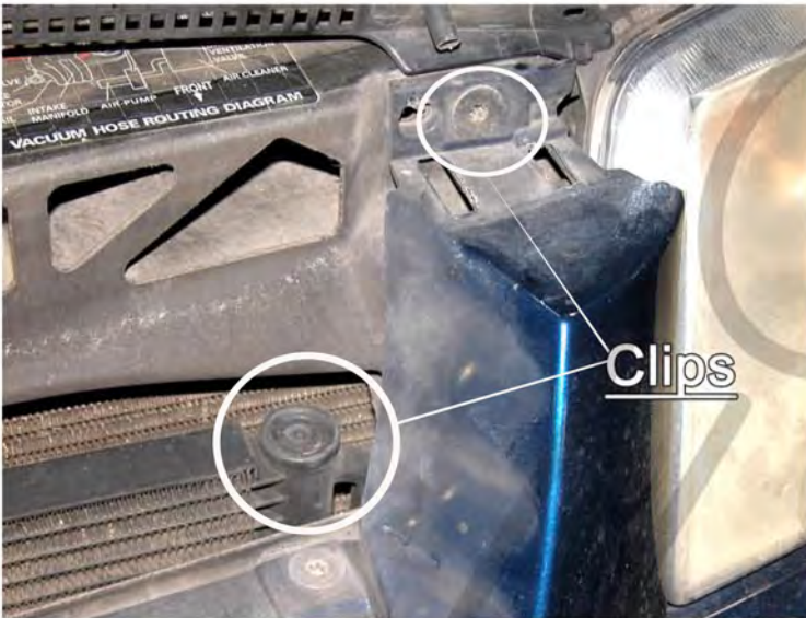
25. There are two clips that need to be installed